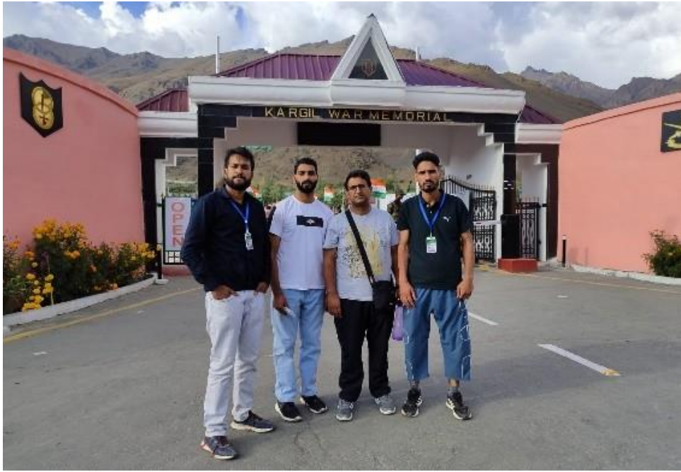
At Kargil War Memorial