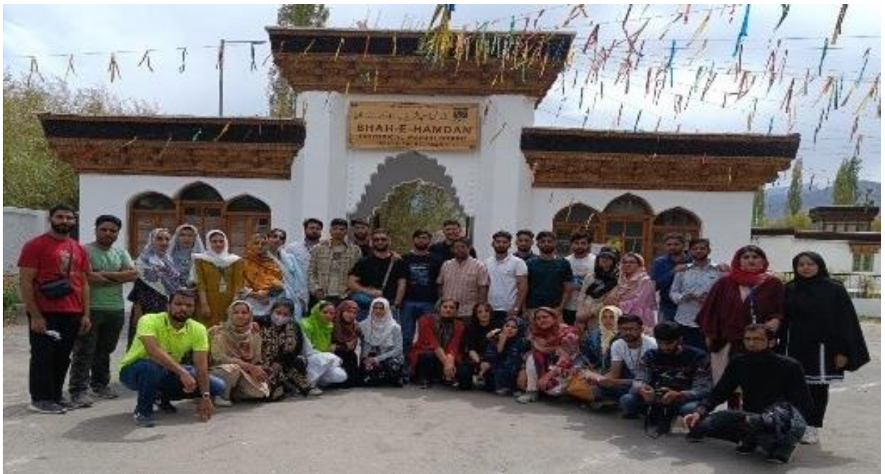
At the entrance of Shey Mosque, Leh