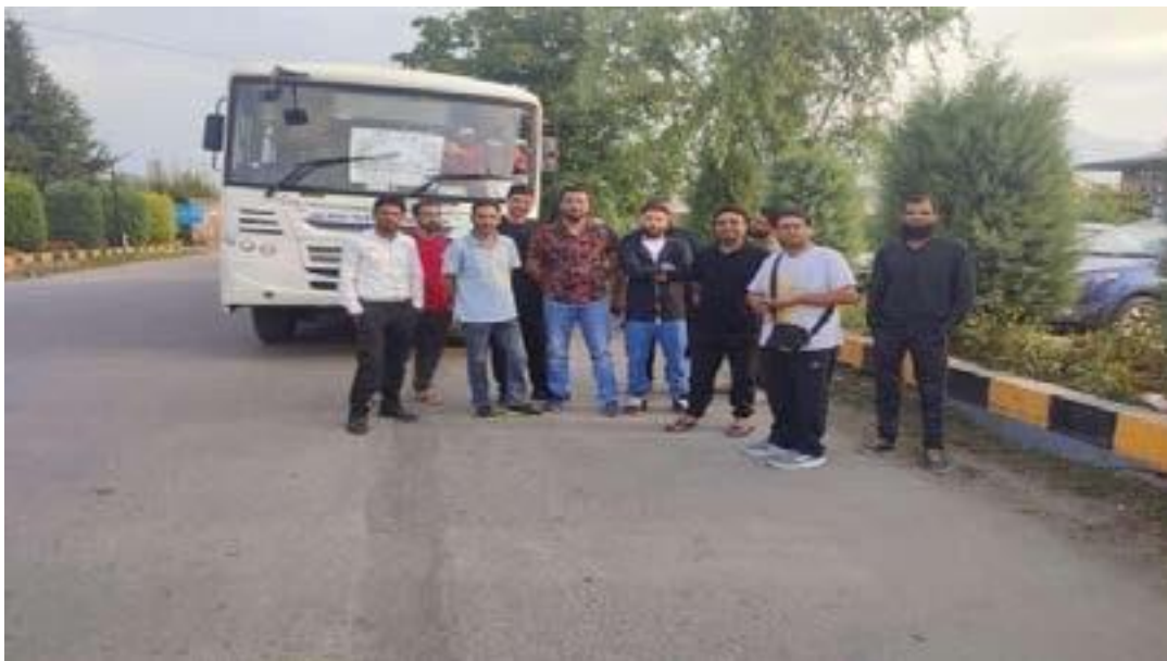
At the time of Departure from the University Campus

Known for its rich Buddhist heritage, Ladakh is home to numerous ancient relics, including statues, monasteries, and artwork that reflect its deep cultural roots. The primary objective of this tour was to familiarize students with the surviving antiquities of the area and to foster a deeper understanding of history through its architectural legacy. Additionally, visits to the museums in Leh and Kargil provided valuable insights into how history is preserved and presented through artifacts left by previous generations.